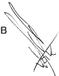
FIG WORLDCUP COMPETITION TRAMPOLINE CategoryB